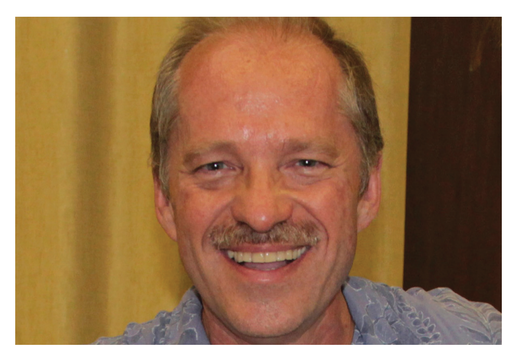
Meet a Member: