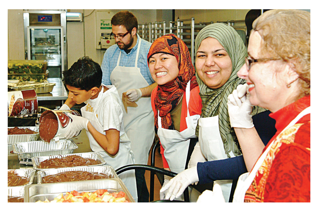
San Jose Jews, Christians and Muslims Unite to Serve